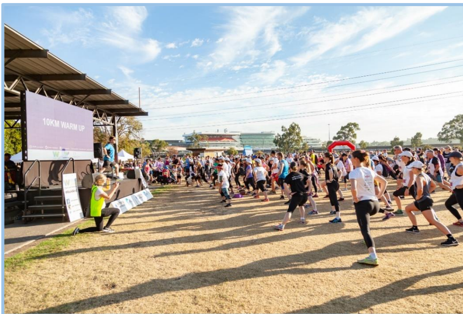
Walk West at Footscray Park.

Download an Event and Festival run sheet template .