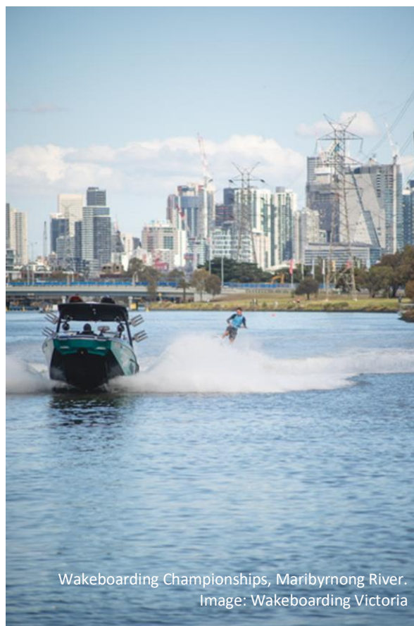
Wakeboarding Championships, Maribyrnong River.

View the Maribyrnong's Single Use Plastics Policy and the Sustainability and Waste Management template for more information.