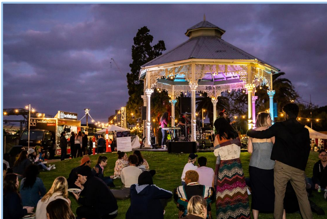
Footscray Night Market at Railways Reserve.