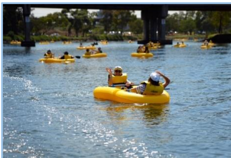
Inflatable Regatta, Maribyrnong River.

View the Emergency Management Template for more information.