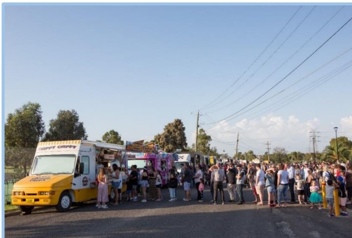
Maribyrnong City Council New Year's Eve Fireworks, Footscray Park.

Download a Food Vendor Checklist and the Temporary Food Stall Layout guide .