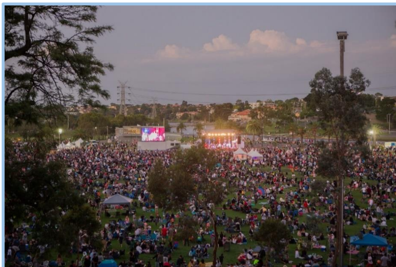
Maribyrnong City Council New Year's Eve Fireworks, Footscray Park.

If you are unsure whether POPE or TOP Permits are required for your event please contact Councils Building department 9688 0196 or send your enquiry to buildingenquiries@maribyrnong.vic.gov.au .