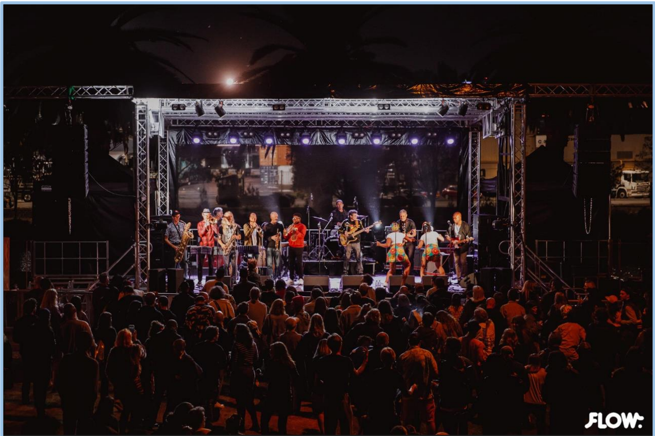
FLOW Festival at Footscray Community Arts Centre.

Download an Event Management Plan template .