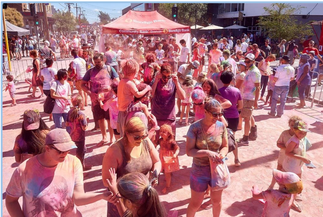
West Footscray Festival of Colours.

Organisers of larger events will need to make individual power arrangements with a third party supplier.