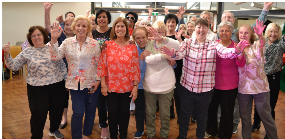
Seniors Month, Oct 2024: lunch and dancing with Elvis created lasting smiles.

Help: NURSE-ON-CALL 1300 606 024 (24-hours)