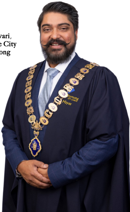
Councillor Pradeep Tiwari, Mayor of the City of Maribyrnong