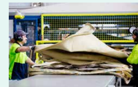
The TIC Group, using state of the art technology to deconstruct mattresses for recycling and resource recovery.

To find out more on how to book a collection and for information on our waste collection services please visit: maribyrnong.vic.gov.au/waste